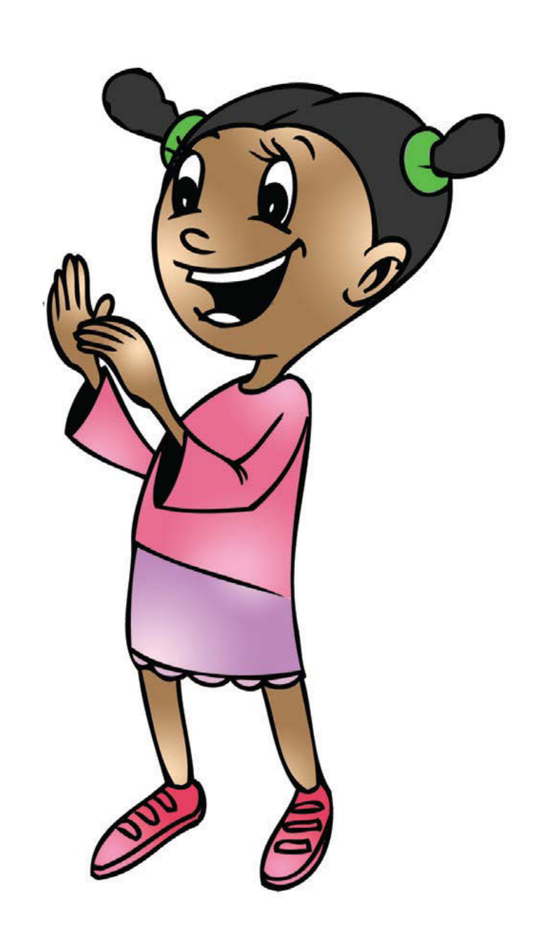
I can clap.