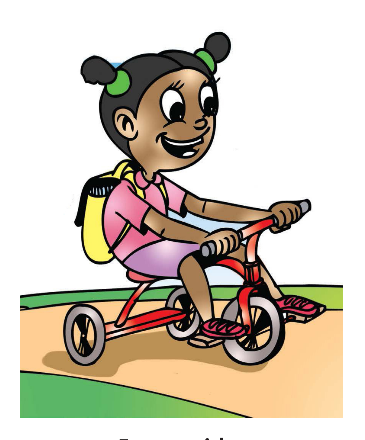
I can ride.