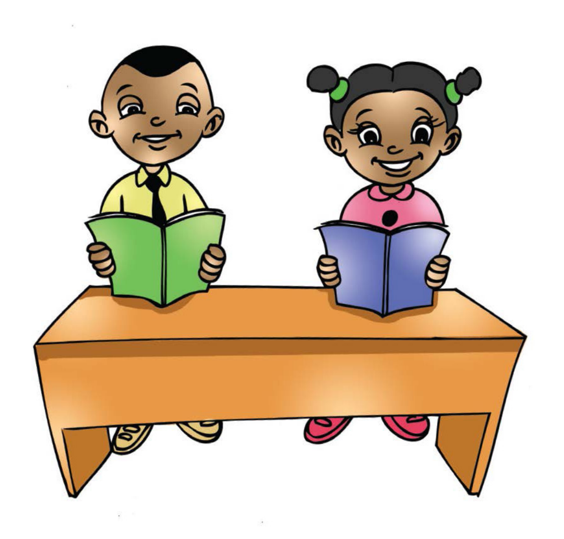
I can read.