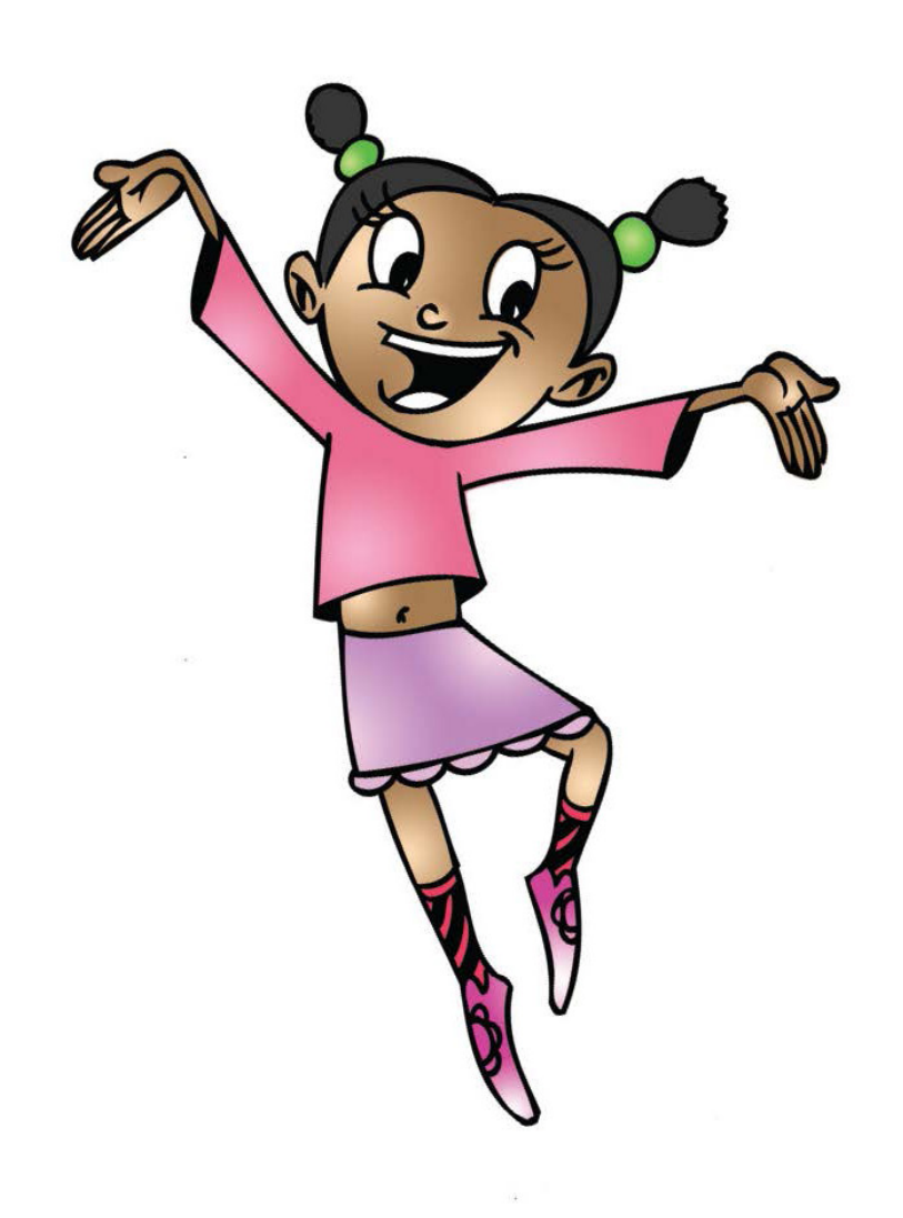
I can jump.