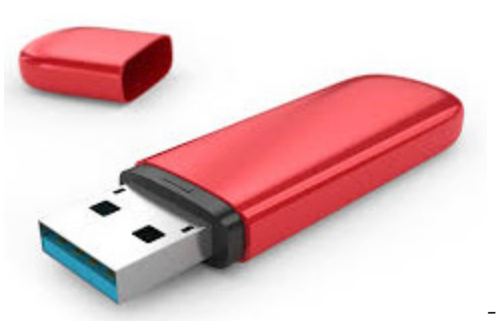
Fig1: A flash disc