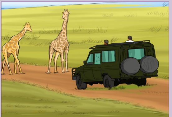
Fig1: Animals in Akagera National park Fig2: Tourists in Akagera National Park